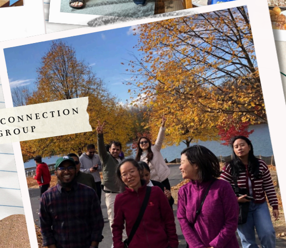
SPOUSE CONNECTION GROUP