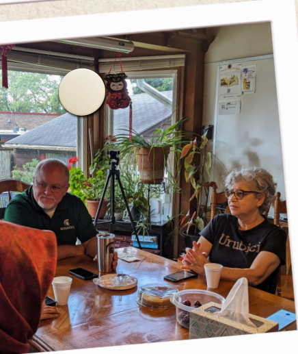
DINING ROOM GATHERING