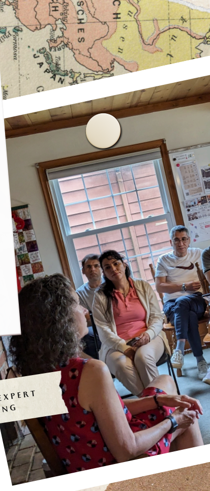
ASK TRE EXPERT MEETING