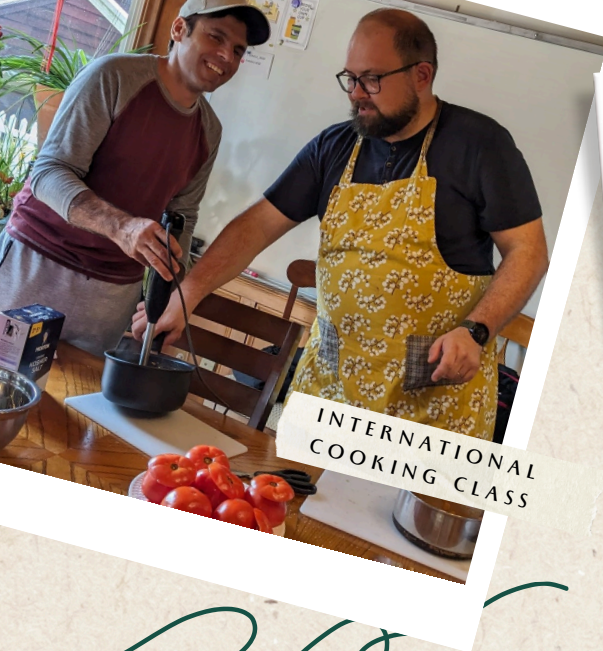
INTERNATIONAL COOKING CLASS