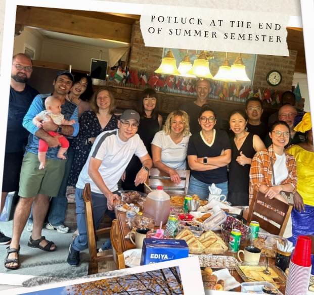
POTLUCK AT THE END OF SUMMER SEMESTER